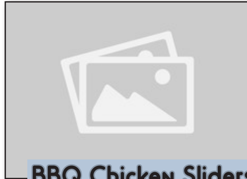
BBQ Chicken Sliders

Three shredded chicken sliders with grilled onions, cooked in & served with our original BBQ sauce